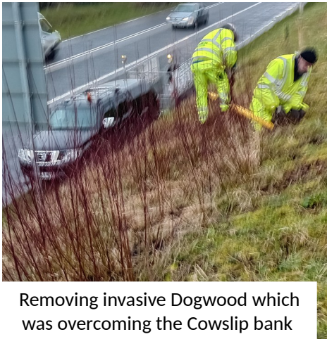
Removing invasive Dogwood which was overcoming the Cowslip bank

Here's the Winter tasks that we managed on less wet days!