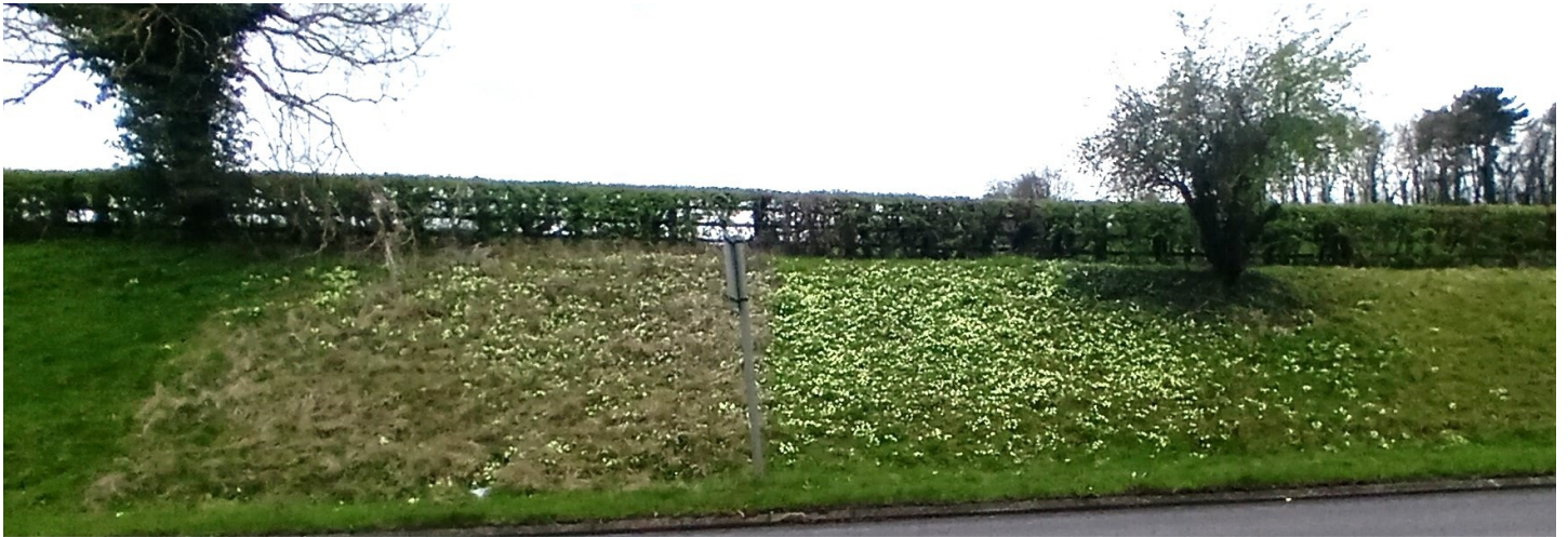
Primroses spreading across the patch where it all started from one small clump in 1990 (note one section left unmown to provide overwintering habitat for insects)