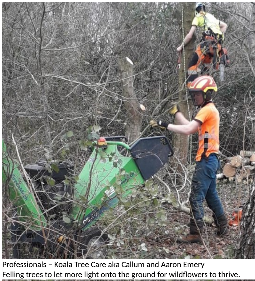
Professionals - Koala Tree Care aka Callum and Aaron Emery Felling trees to let more light onto the ground for wildflowers to thrive.