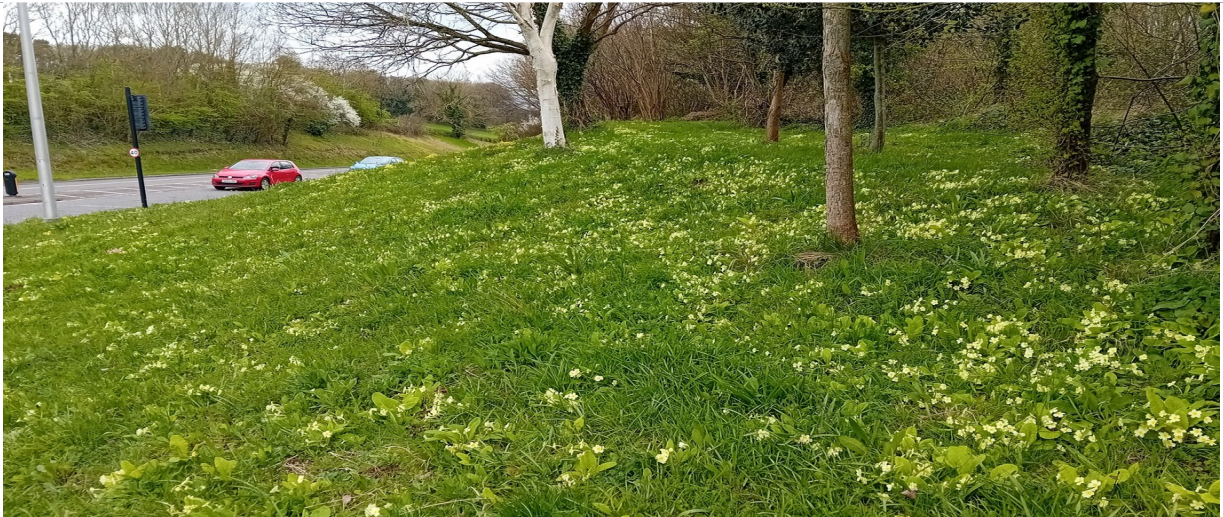
Primroses are now establishing in several other parts of the Reserve